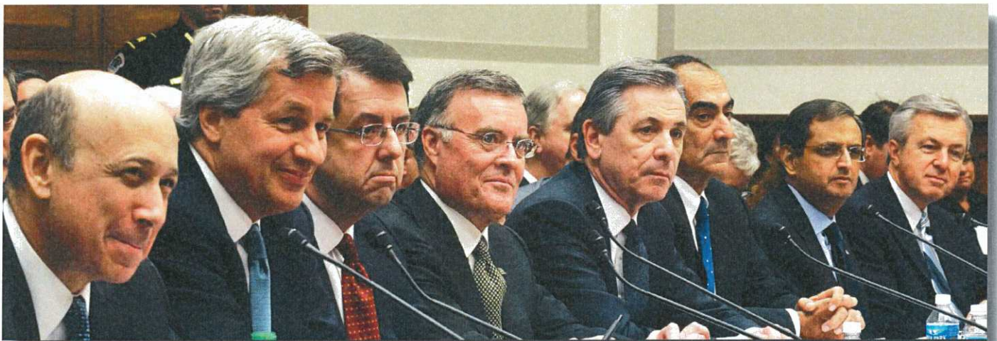
CEOs from Goldman Sachs, JPMorgan Chase, Bank of New York, Bank of America, State Street, Morgan Stanley, Citigroup, and Wells Fargo testify before bailout hearings in 2009.

to which consumers are subject. 9 Such clauses require Americans to "agree" to surrender fundamental constitutional rights, often without ever realizing it. Legal disputes are funneled into a secret system where there is no right to go to court, no right to a jury, no right to a written record, no right to discovery, no legal precedents to follow, and no judicial review.